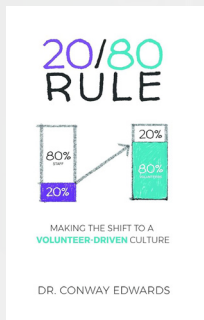
20/80 Rule Conway Edwards