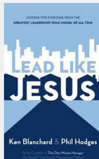
Lead Like Jesus Ken Blanchard